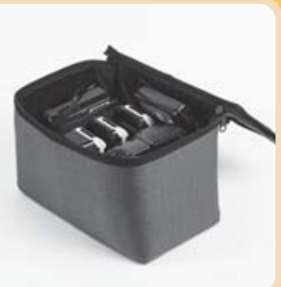
Optional accessory bag for transportsafe packaging of of spare batteries, chargers, etc.

Integrated acquisition and control software offers worldwide, fast and cost-effective information exchange via cloud or email